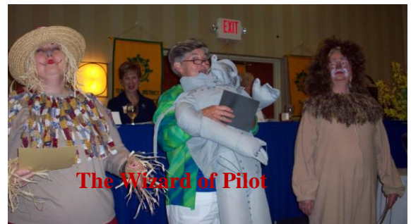
The Wizard of Pilot