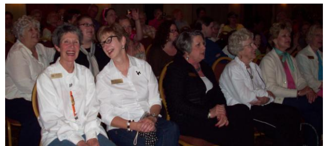
Pilots having fun!!!!!!