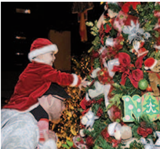
Fantasy of Trees Benefit for East TN Children's Hospital November 27-Dec. 1